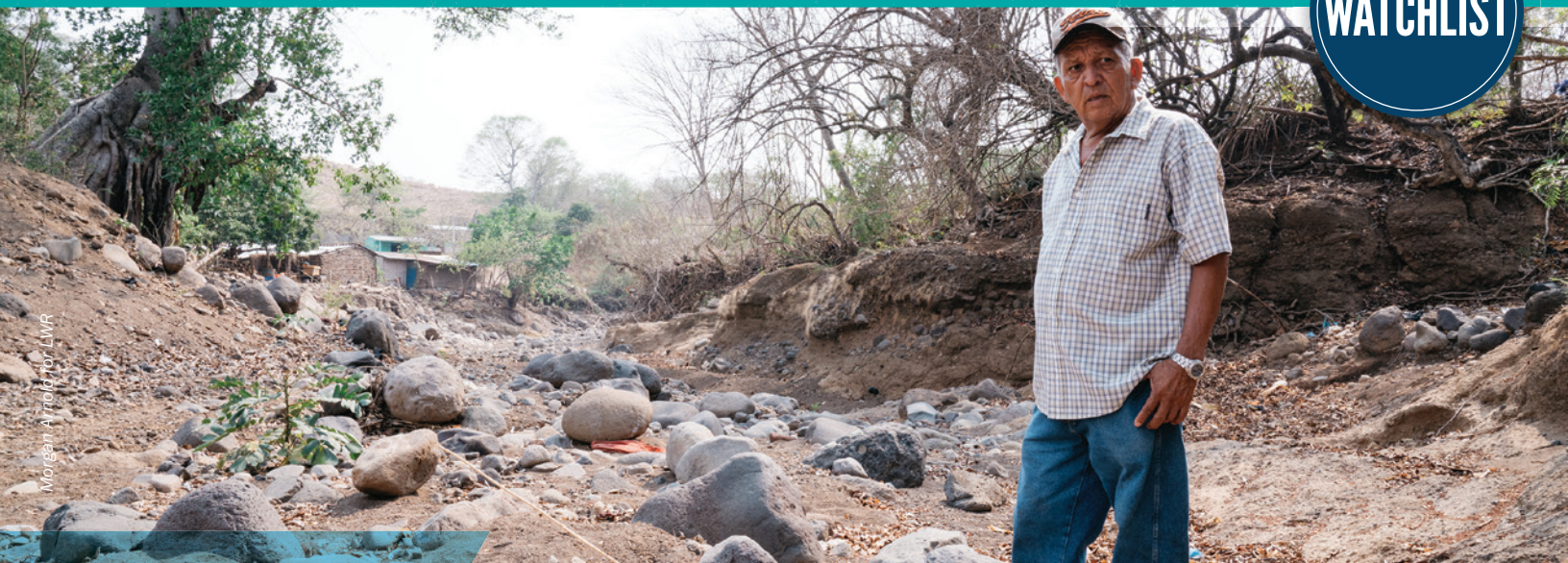
Morgan A. Ford for LWR

THOUGH CONFLICT THERE HAS A LESS OBVIOUS FORM, CENTRAL AMERICA'S VIOLENT CURRENT CONTEXT COMES OUT OF CIVIL WARS THAT GRIPPED EL SALVADOR AND GUATEMALA DURING THE 1980S, FOUGHT WITH VARYING DEGREES OF U.S. MILITARY SUPPORT, AND HAVE GIVEN WAY TO CRIMINAL ACTIVITY BY GANGS AND CRIMINAL ORGANIZATIONS THAT HAVE FORCED MANY FAMILIES TO FLEE.