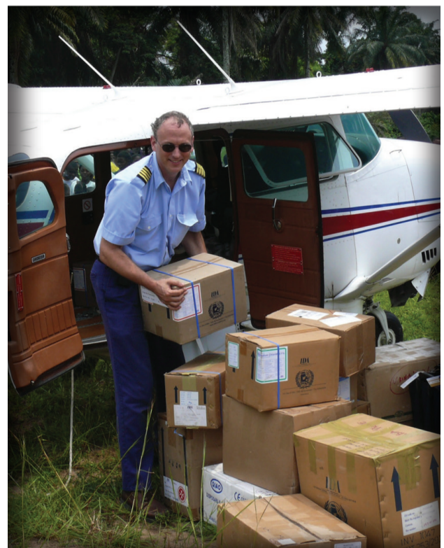
Responding quickly with barrier materials to protect health workers

IMA World Health staff was heavily involved in addressing two of DRC's largest Ebola outbreaks, those of 1995 and 2007. IMA's rich history of collaborating with the MOH, local leaders, and FBOs in building and maintaining Congo's health care system and our mission made us well-placed to help lead the response. In both outbreaks, IMA worked closely with the MOH, outside organizations (including the CDC, WHO and other NGOs), and the local populations to