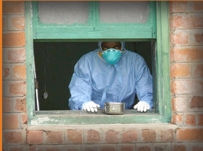
Ebola has impacted the DRC more than any other country

IMA World Health's work on the frontlines of strengthening fragile healthcare systems often brings us in contact with new infectious disease outbreaks. Nowhere is this more pronounced, and deadly, than in the Democratic Republic of Congo (DRC), where we have worked in close concert with the Ministry of Health (MOH), our faith-based health facility partners and networks, civil society organizations (CSOs), and international health agencies to confront and control nascent Ebola outbreaks since 1995.