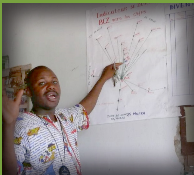
Tracking contacts of Ebola patients at Bulape hospital